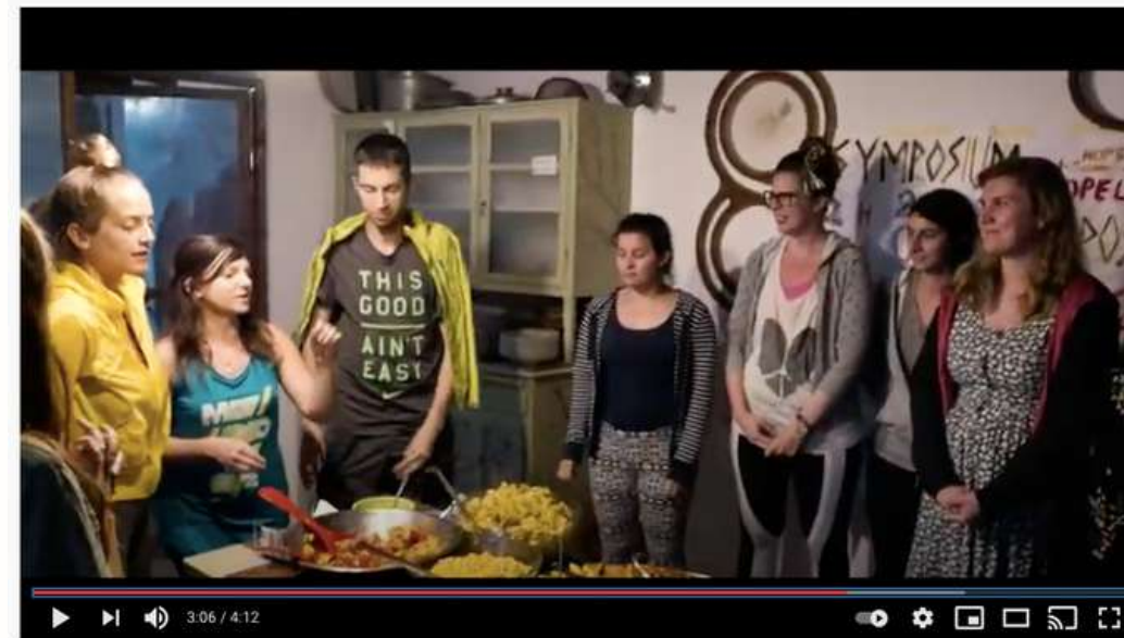
02 Symposium [May 2018]